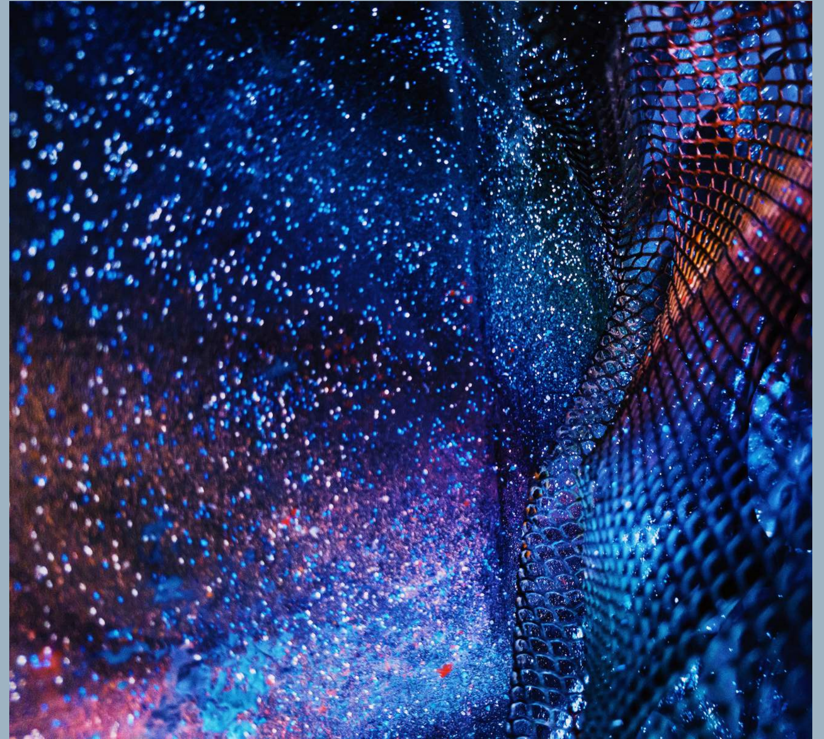
A time for rest. Relax and listen to the space-like music as the lights get darker.