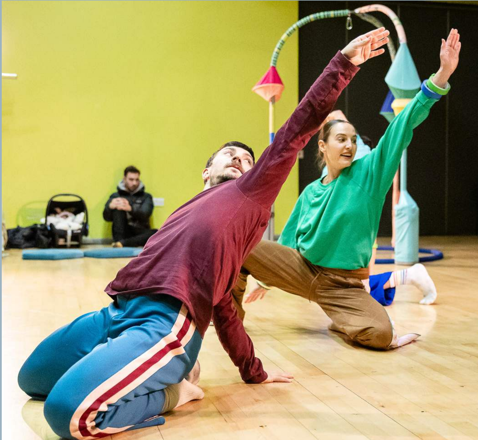
Gliding and leaping with the dancers.