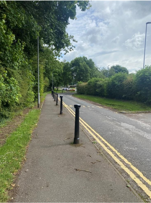
Entrance/Exit walkway from/to the festival.