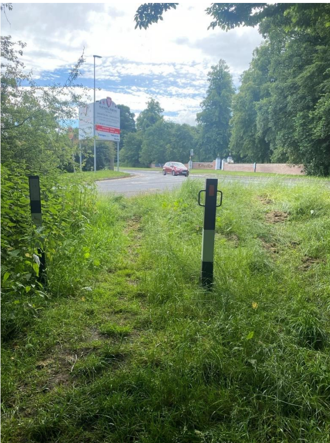
Entrance to river walk leading to the festival